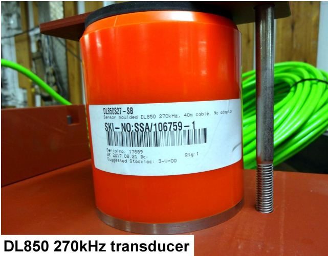
DL850 270kHz transducer