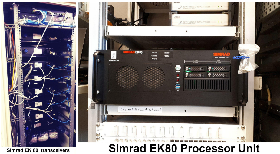
Position of Devices in Polarsterns box keel