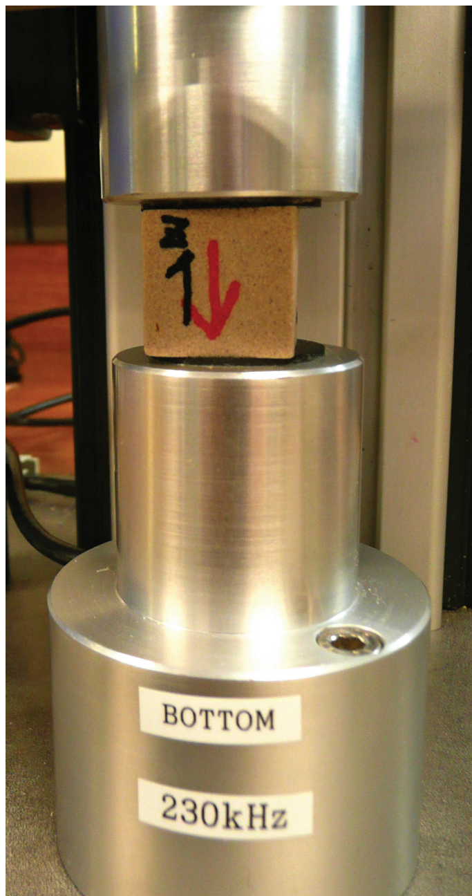
Ultrasonic transducers from the MSCL-DPW

For measurements on hard rock samples, it is important to apply a small but constant pressure on the sample during the measurement. This can be difficult to achieve manually, but is automatically accomplished with the MSCL-DPW. When the correct set pressure is reached on a rock sample the handle disengages from the ball screw preventing further pressure being applied. This enables the user to easily apply the same pressure on every sample for repeatable and consistent measurements.